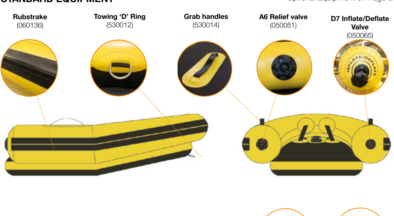
Optional Equipment on Page 38